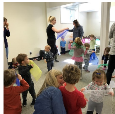
Kick Dance Studio teachers showing us some new moves

During October , our favorite dogs from the ASPCA were back listening to children reading many different stories to them.