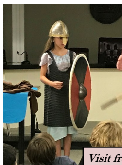
Visit from the American Swedish Historical Museum of Philadelphia