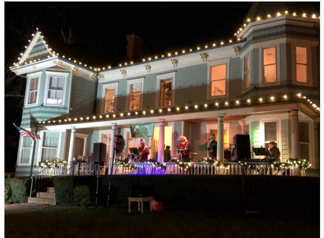
Tower Hill's "The Elf Band", who performed Christmas classics.