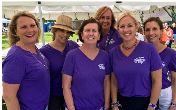
Members of the 2018 Fair Haven Day Committee

I would also like to once again recognize and thank all of the many people