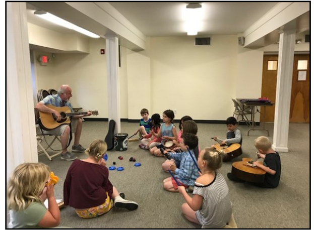
LS School of Music and Drama

many happy recipients for all the fun prizes offered. The library would like to thank Crazies in Rumson, again this summer, for their generous gift cards donation! Yeah for ice cream!