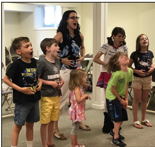
American Swedish Museum