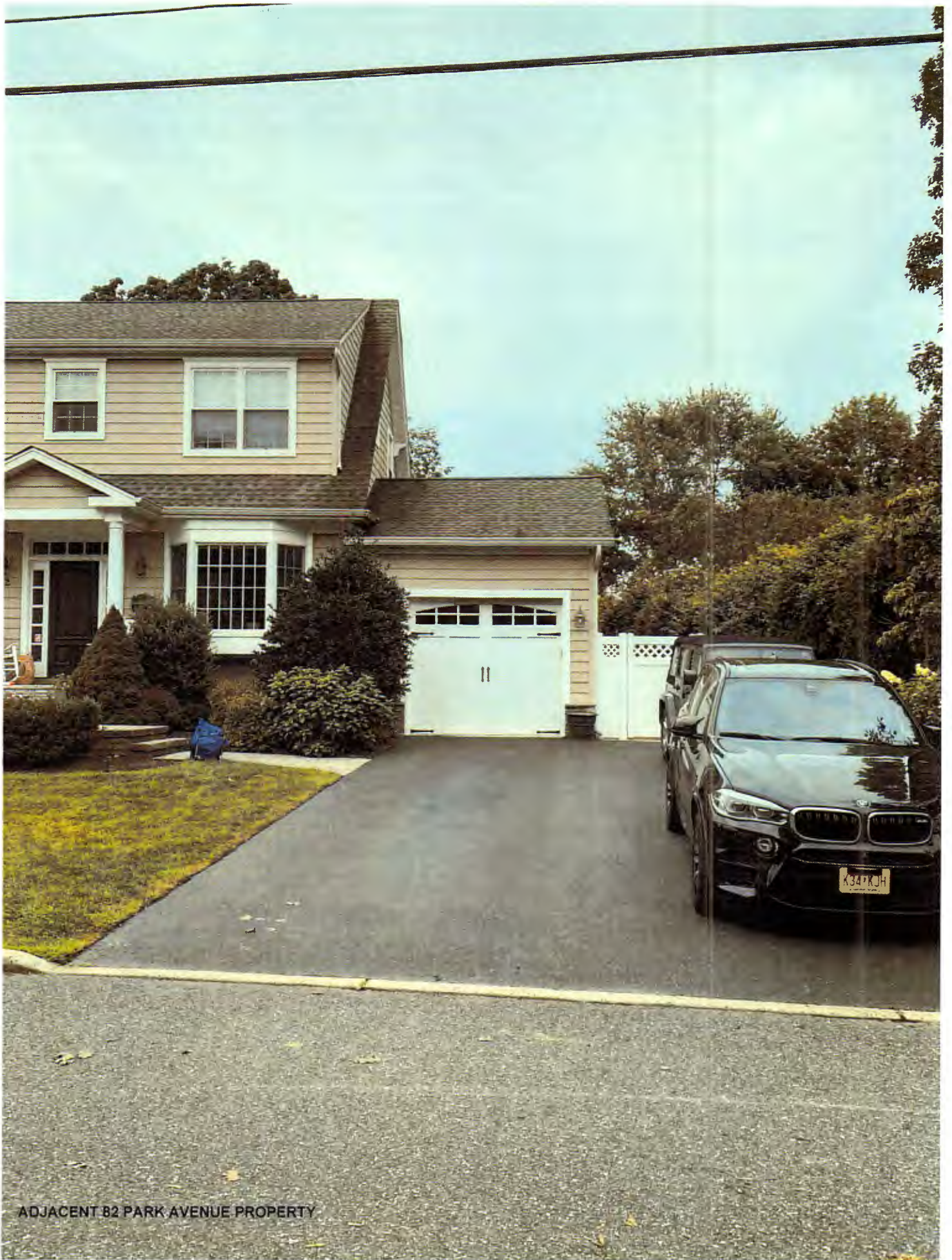
ADJACENT B2 PARK AVENUE PROPERTY