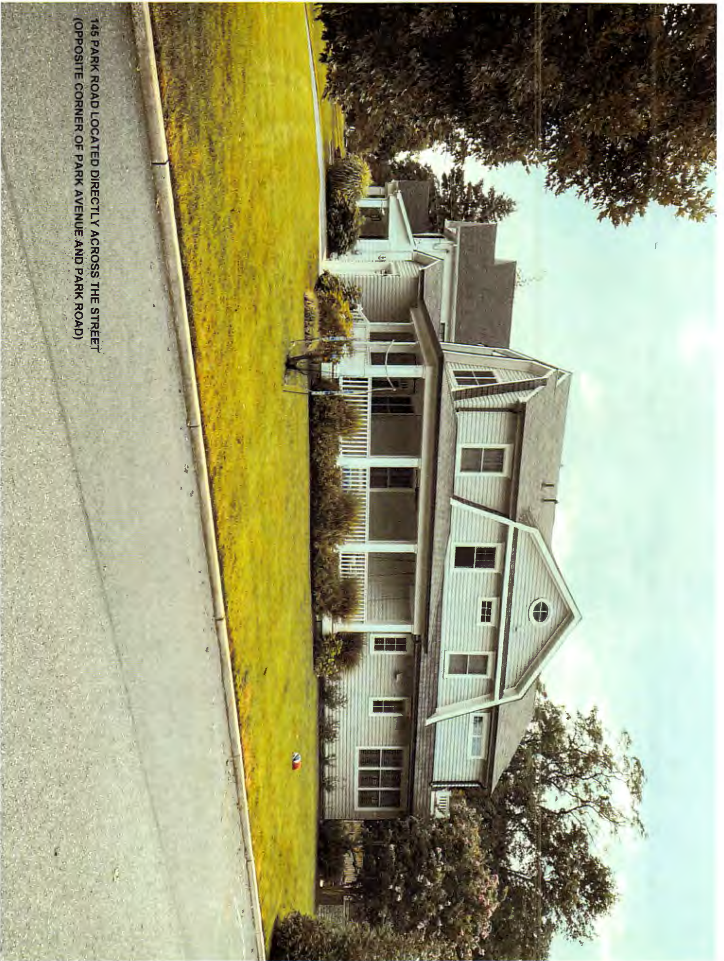
145 PARK ROAD LOCATED DIRECTLY ACROSS THE STREET (OPPOSITE CORNER OF PARK AVENUE AND PARK ROAD)