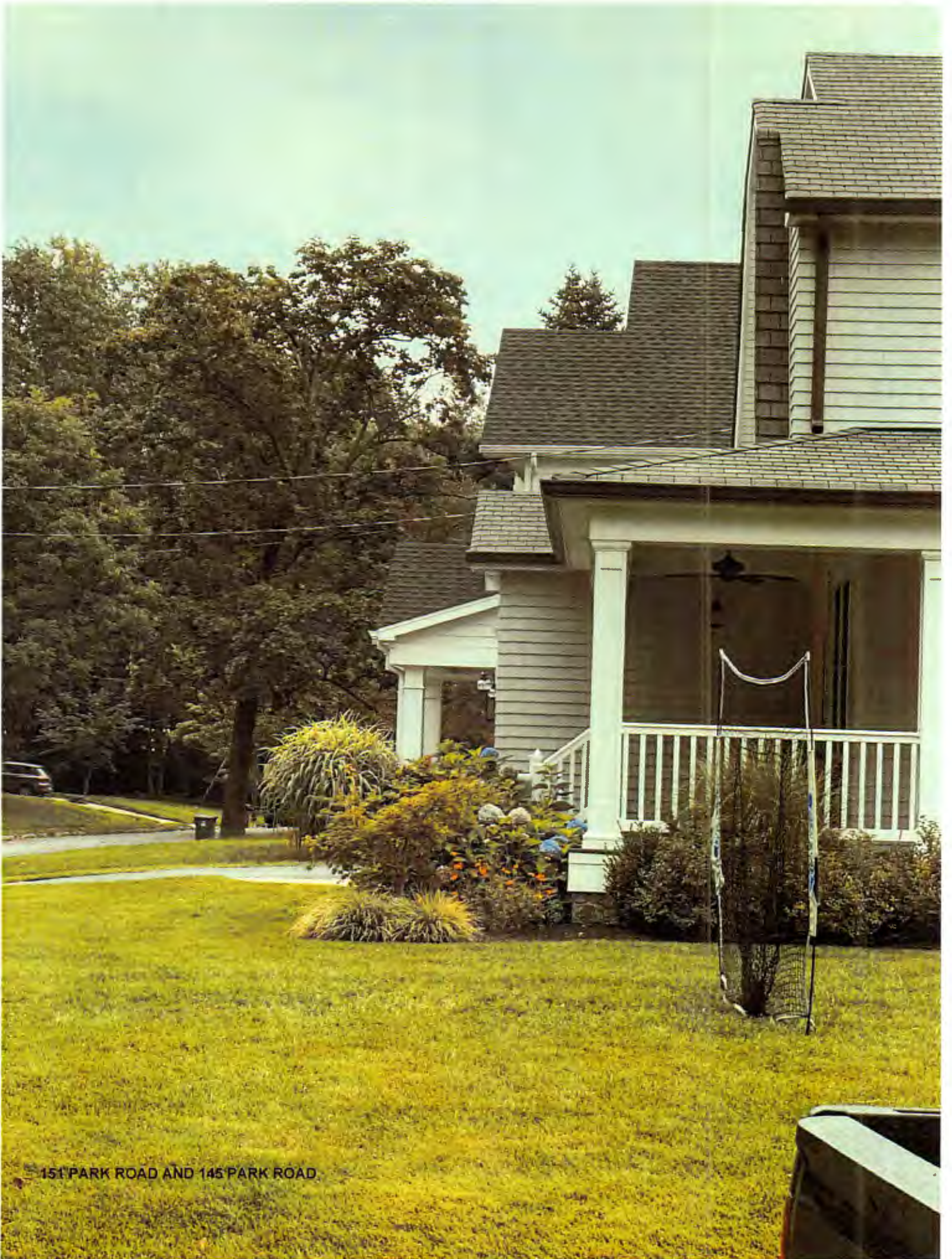
151 PARK ROAD AND 145 PARK ROAD