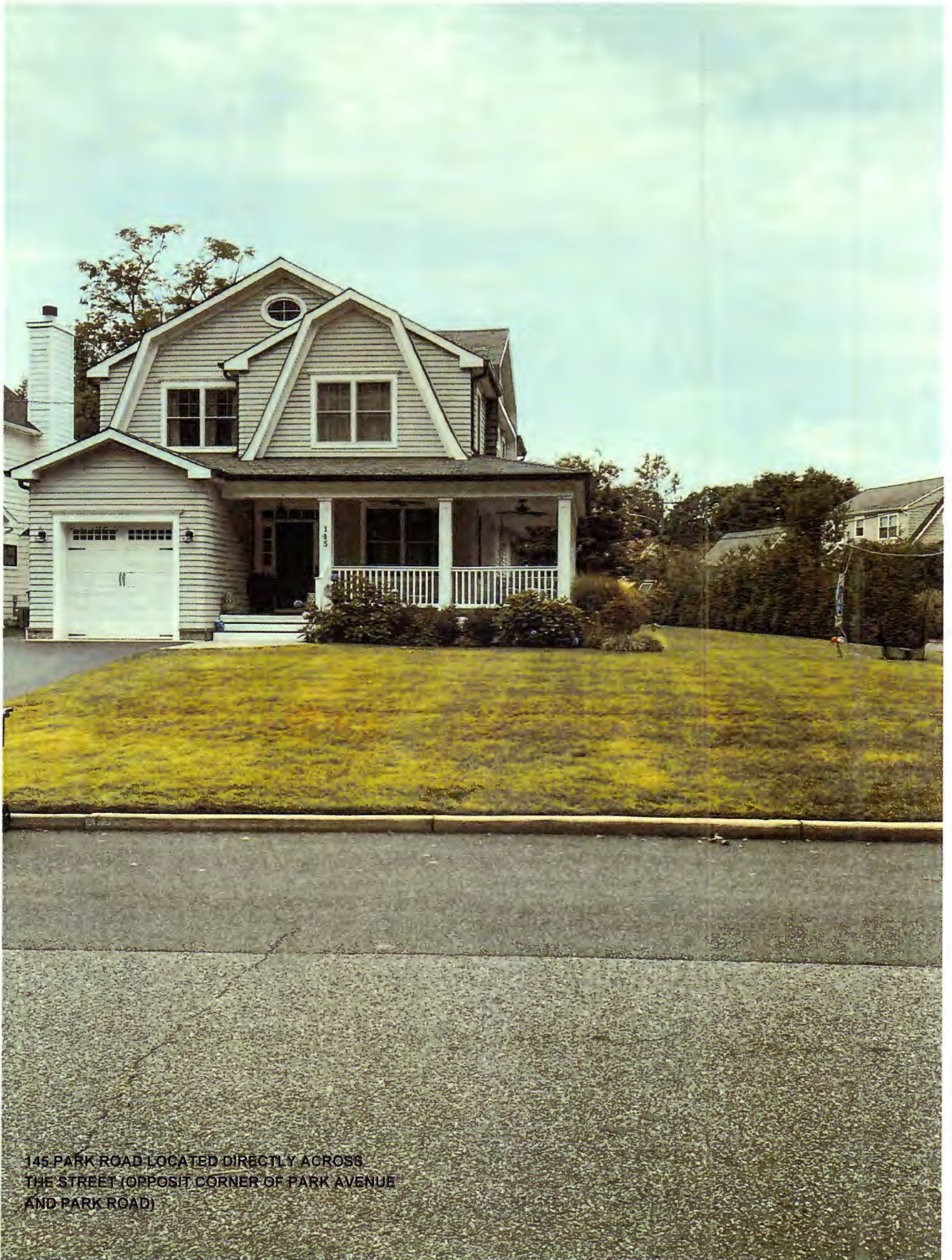
145 PARK ROAD LOCATED DIRECTLY ACROSS THE STREET (OPPOSIT CORNER OF PARK AVENUE AND PARK ROAD)