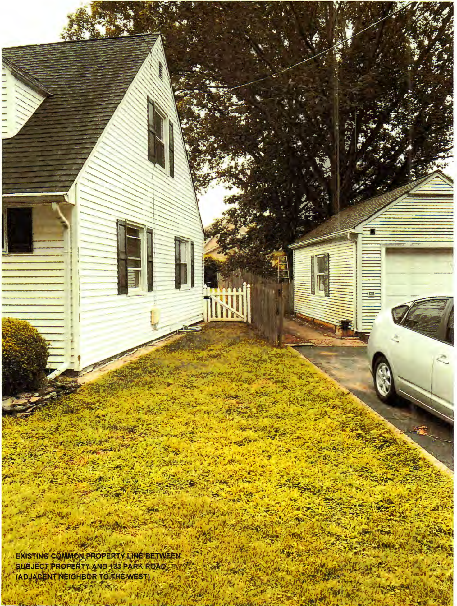
EXISTING COMMON PROPERTY LINE BETWEEN SUBJECT PROPERTY AND 133 PARK ROAD (ADJACENT NEIGHBOR TO THE WEST)