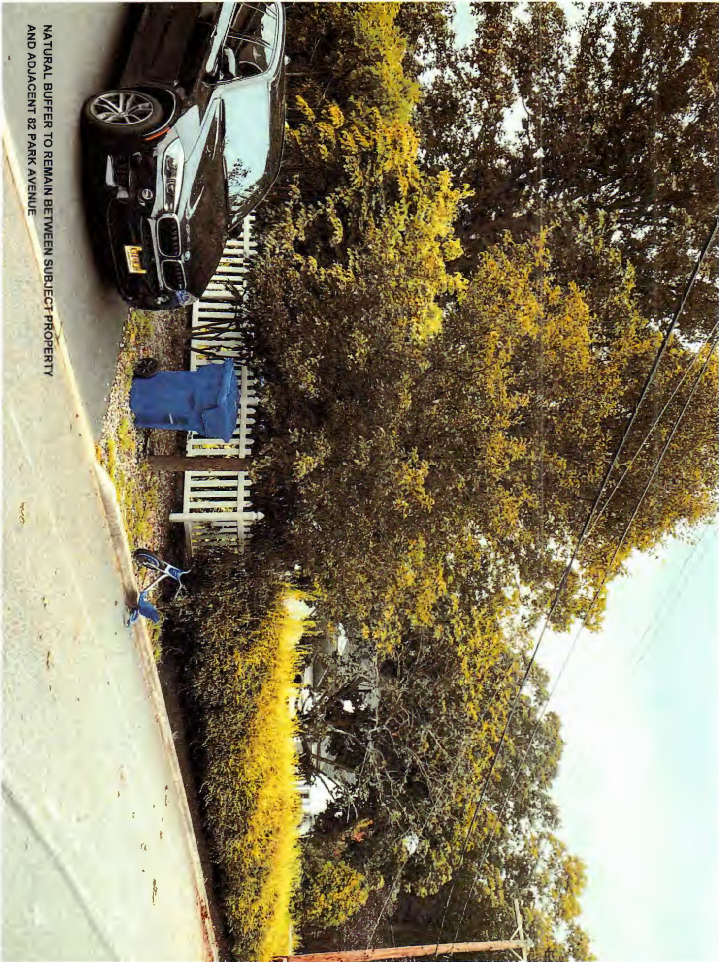
NATURAL BUFFER TO REMAIN BETWEEN SUBJECT PROPERTY AND ADJACENT 82 PARK AVENUE