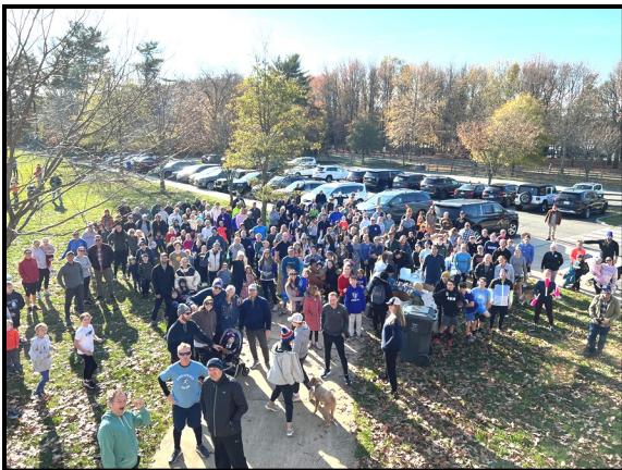
Overwhelming attendance with 200 people showing up on a stunning day for a trot, activities, and refreshments.

The Ninth Annual Fair Haven Turkey Trot was well attended early in the day with plenty of runners, walkers, and holiday revelers under clear and sunny skies on Thanksgiving morning. Kids and adults came out to trot, walk their pets, and play some games throughout Fair Haven Fields. Many contributed donations to the annual U.S. Marines’ Toys for Tots drive, which continues in town for a few more weeks. The crowdsourced hot cocoa and snacks were a hit for all attendees. The event is produced annually with no cost and no registration making it easy to participate. We even had folks visiting family from across the eastern seaboard as far as Massachusetts and Maryland.