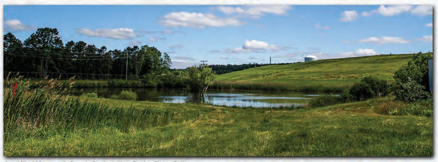
Landfill at Monmouth County Reclamation Center, Tinton Falls