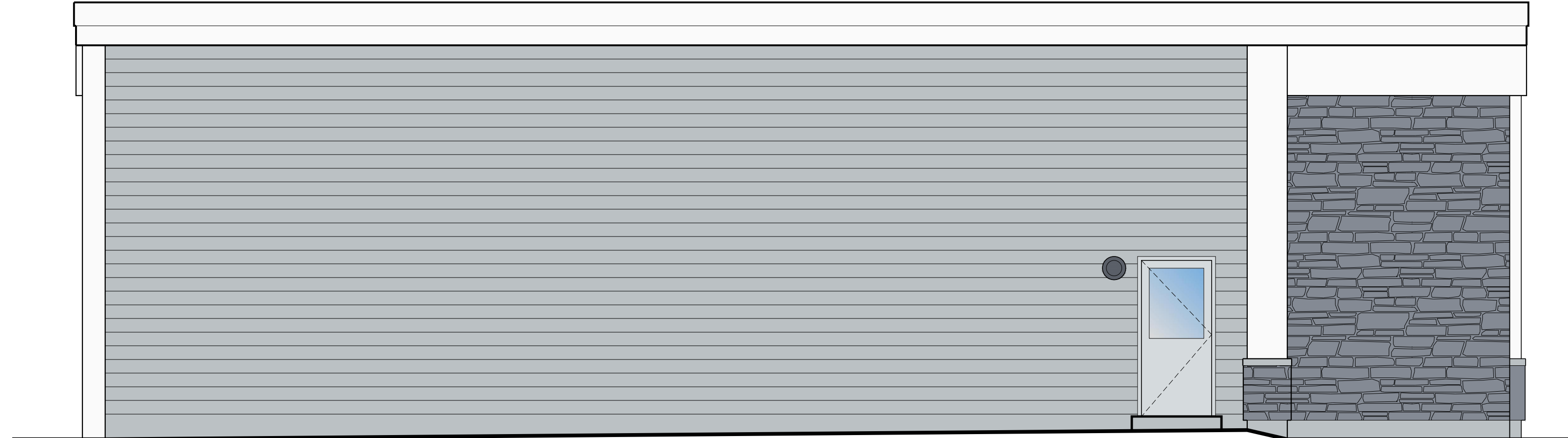
④ PROPOSED NORTH ELEVATION SCALE: 1/8" = 1'-0"