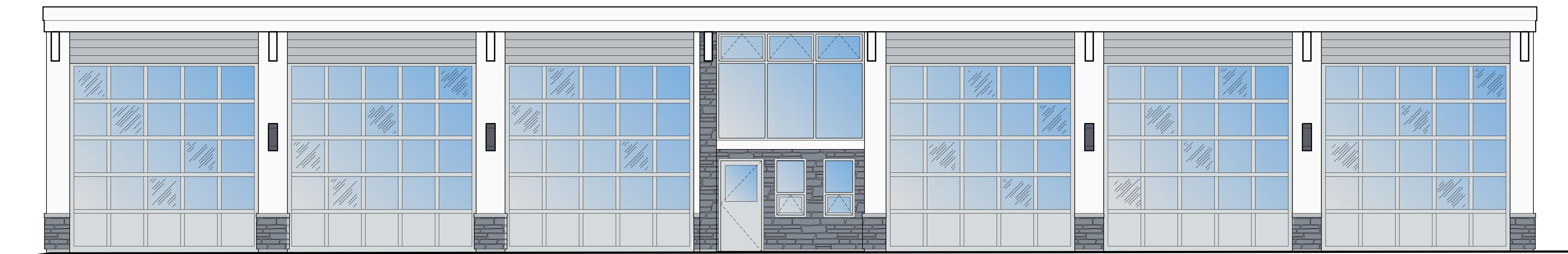
① PROPOSED WEST ELEVATION SCALE: 1/8" = 1'-0"