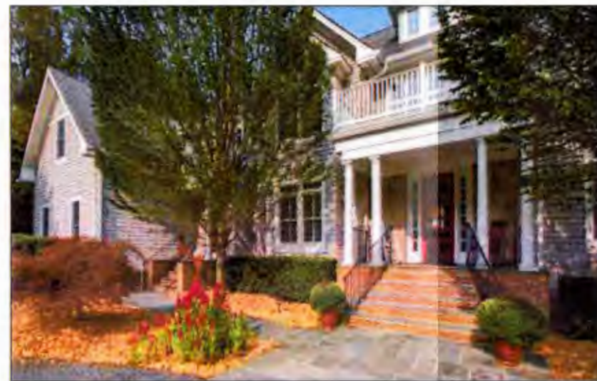
33 BUENA VISTA