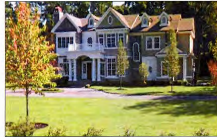
31 BUENA VISTA