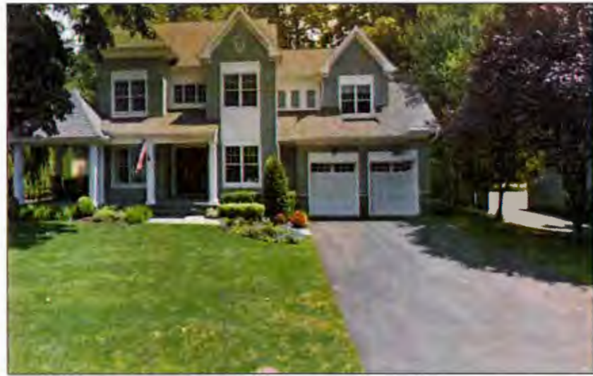
16 HILLSIDE PL.