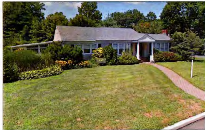
35 HILLSIDE PL.