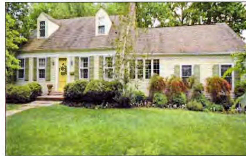
220 BUENA VISTA