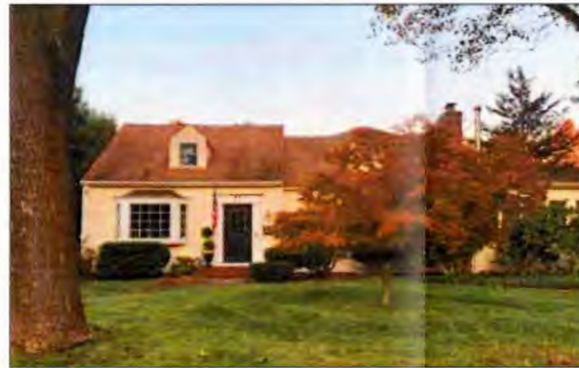
57 S. WOODLAND DR.