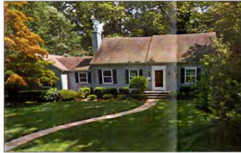
24 HILLSIDE PL.