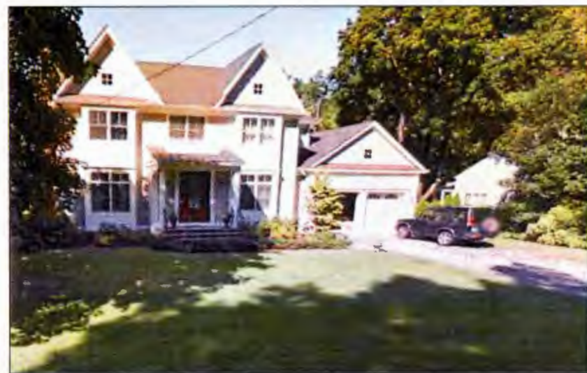
202 BUENA VISTA