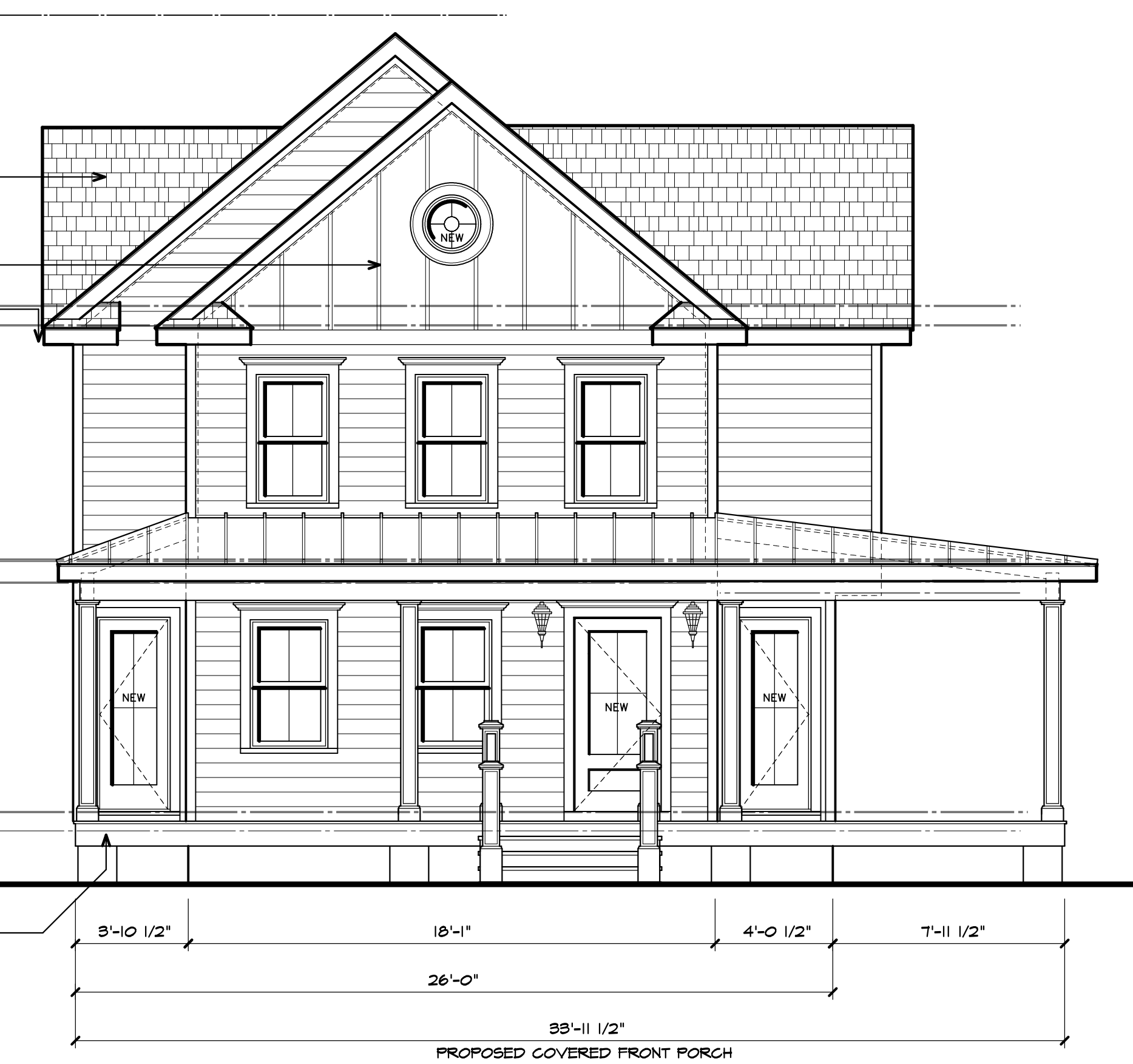
PROPOSED FRONT ELEVATION (WILLOW STREET) SCALE: 1/4" = 1'-0"