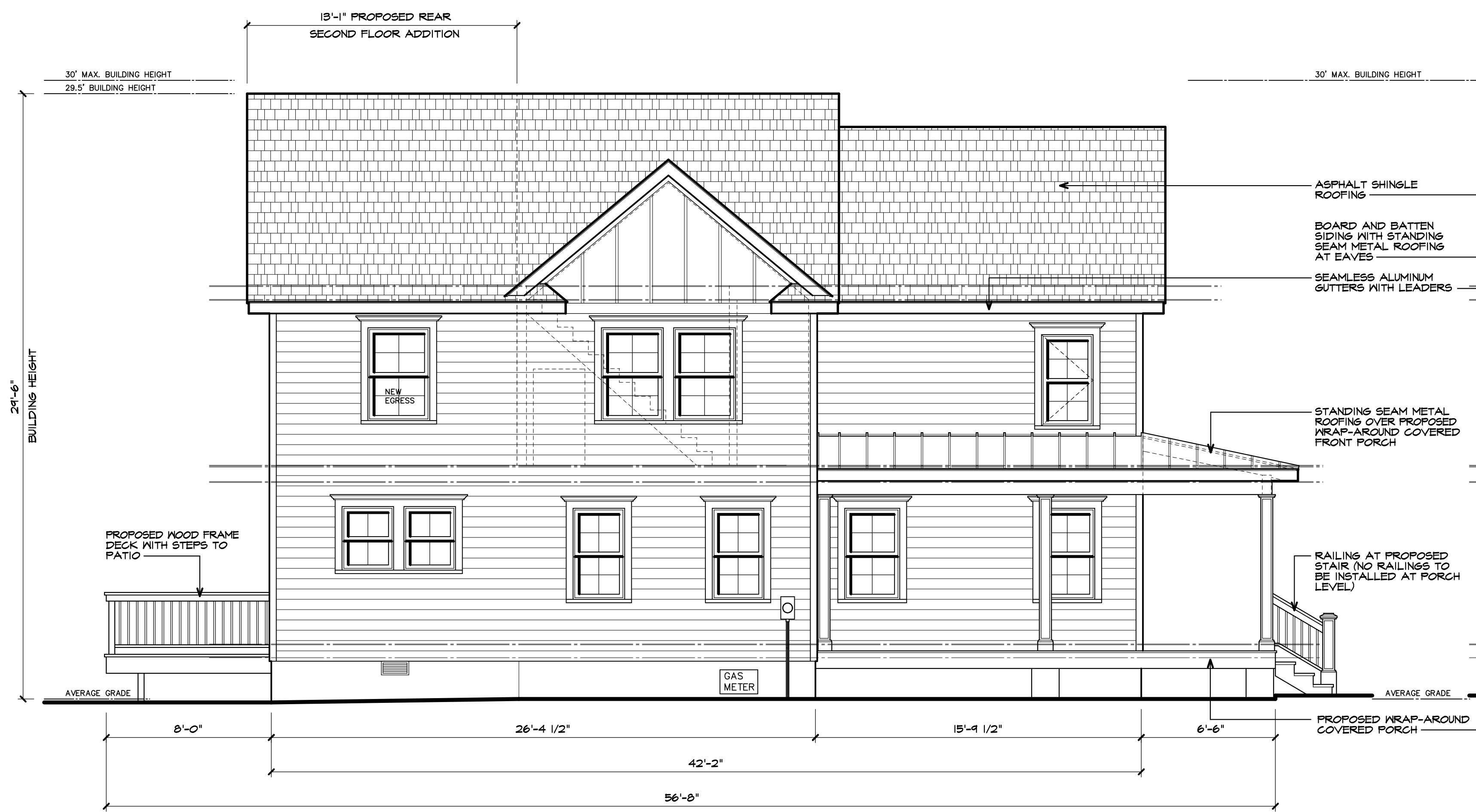
PROPOSED FRONT ELEVATION (OAK PLACE) SCALE: 1/4" = 1'-0"

Contractor shall verify all field conditions and dimensions and be responsible for field fit and quantity of work. No allowances shall be made on behalf of the contractor for any error or neglect on his part. Drawings shall not be scaled. This document and the ideas and designs incorporated herein, as an instrument of professional service, is the property of DUGASZ & BROWER ARCHITECTS, Inc. and shall not be used in whole or in part for any other project without the written authorization of DUGASZ & BROWER ARCHITECTS, Inc. All rights reserved © DUGASZ & BROWER ARCHITECTS, P.C.