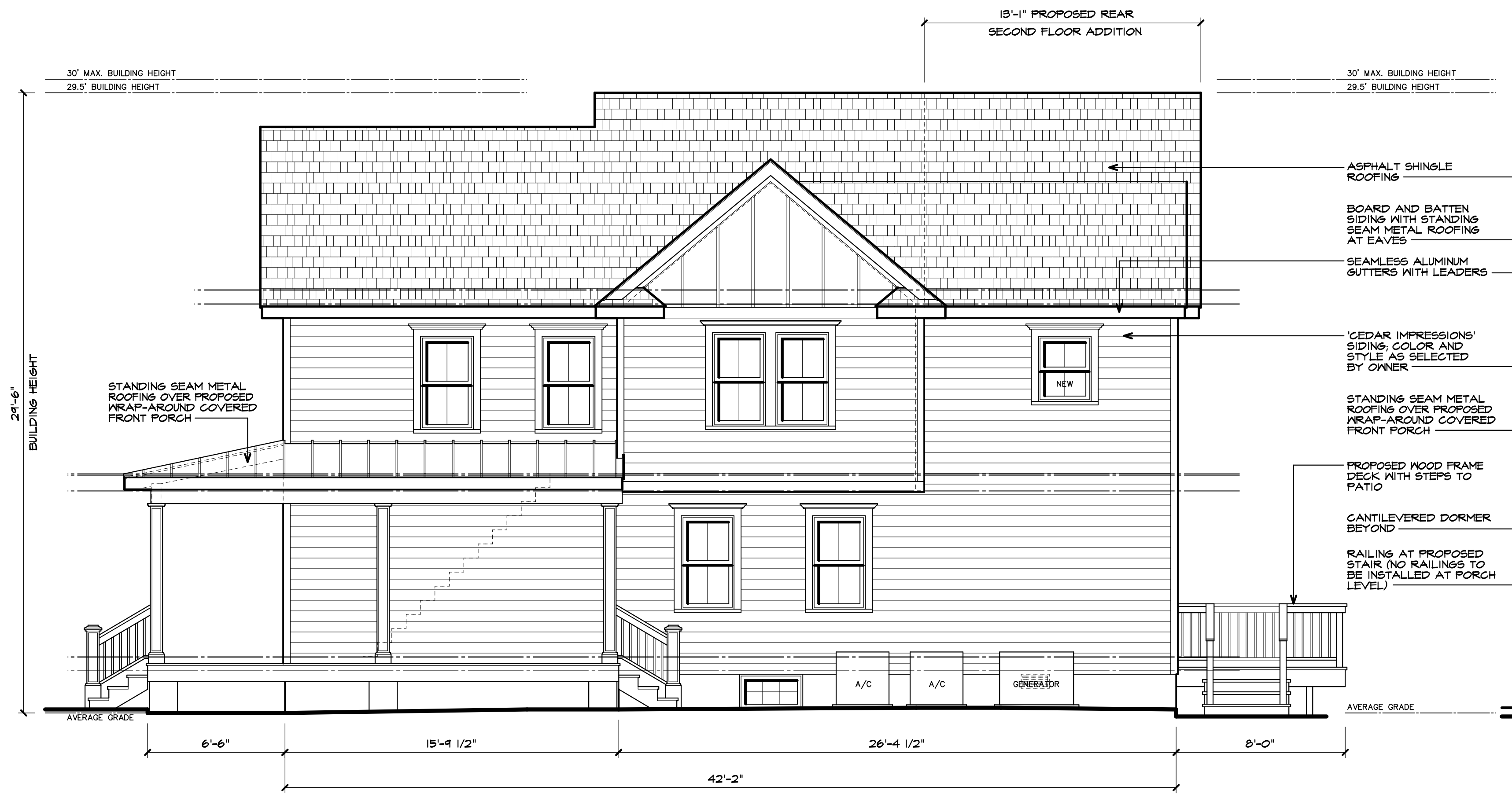
PROPOSED RIGHT SIDE ELEVATION SCALE: 1/4" = 1'-0"