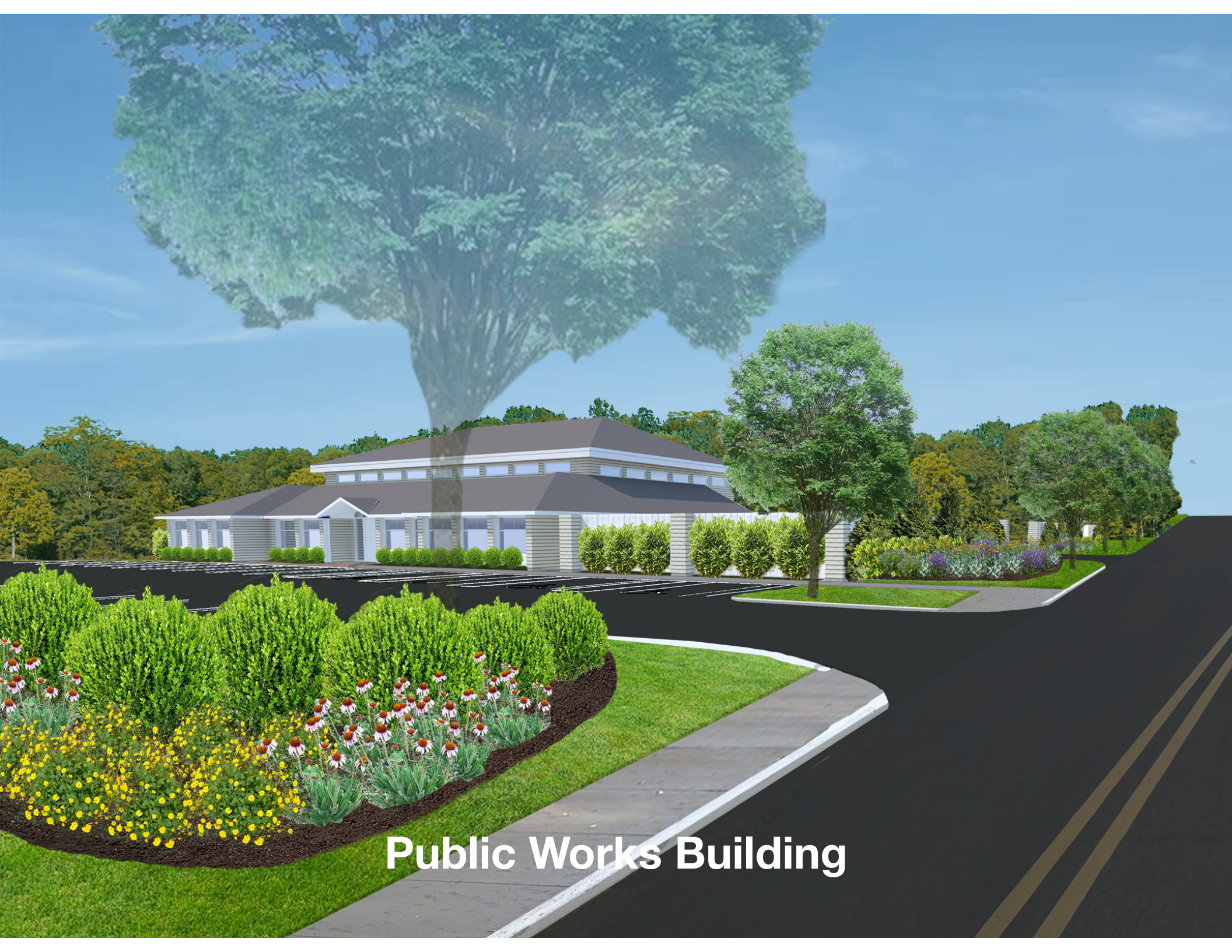
Public Works Building