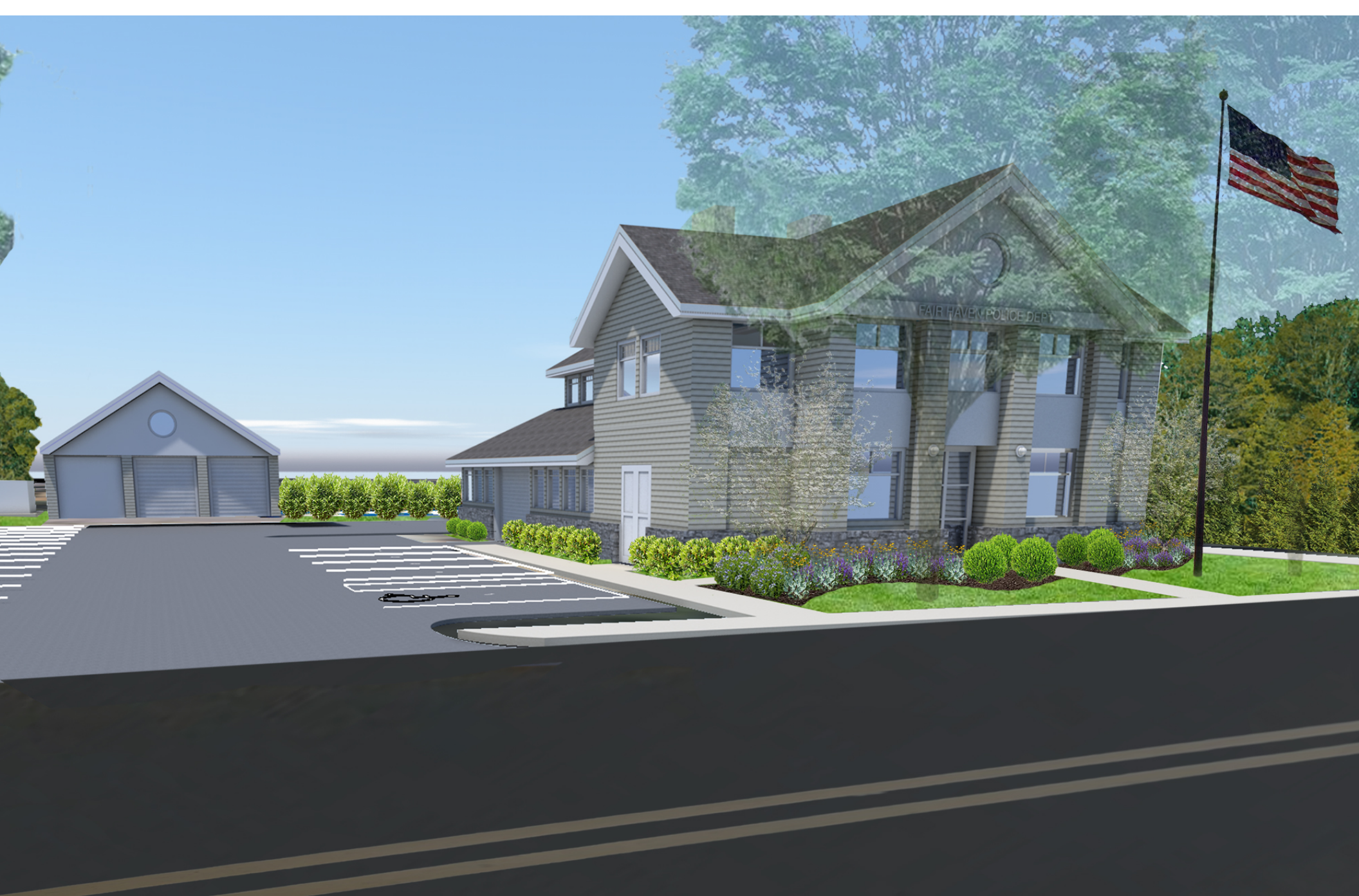
Police Building with Storage Building