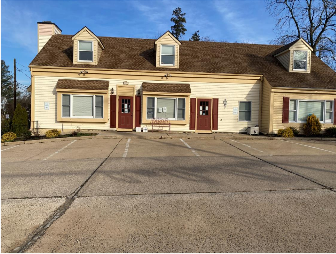
Existing exterior (left side):