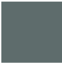
Siding/Door: Benjamin Moore Knoxville Gray HC-160